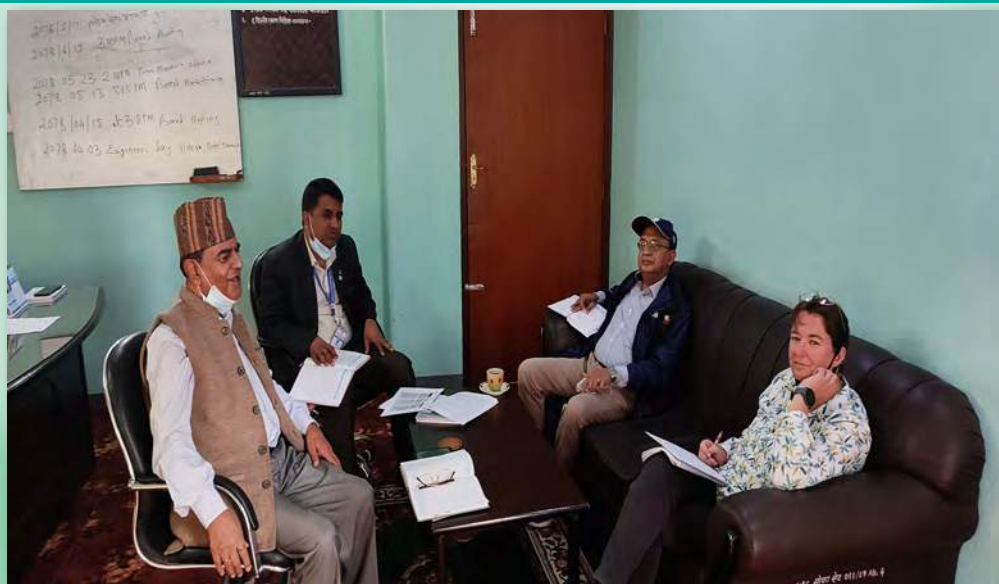
मिति २०७८/०६/१५ गते नेपाल इन्जिनियरिङ्ग परिषद् र Institution of Civil Engineers (ICE), (UK) का सदस्यहरु बीच भएको बैठक ।