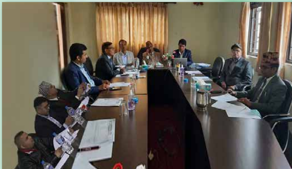
परिषद्को नियमित बैठक ।